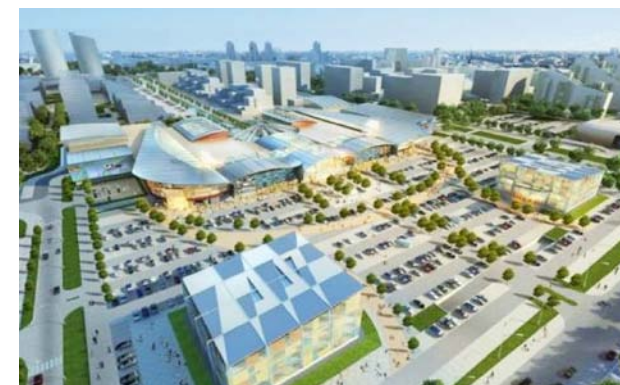
Multifunctional complex YUZH NAYA PLOSHAD