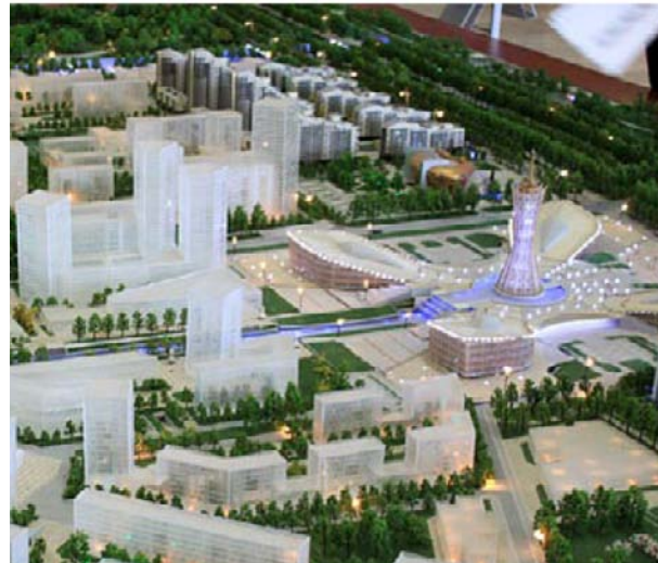
Residential district BALTIC PERI