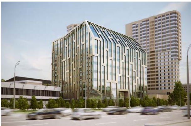
Business centre LEVIUM CENTER

Class A office building in a prestigious district of Moscow.