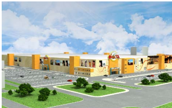
Retail and entertainment complex Fiesta