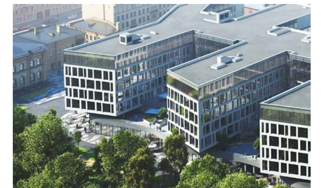
Multifunctional complex SAN GALLY PARK