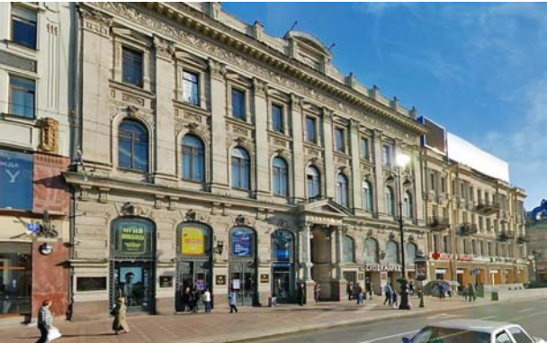
Retail centre PASSAGE

The project is located in the historic city center on Nevsky Prospect.