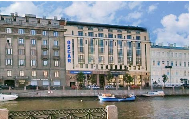
Business centre OSCAR