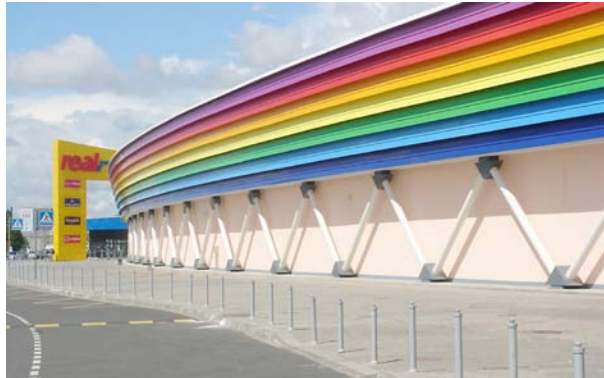
Retail and entertainment complex RADUGA