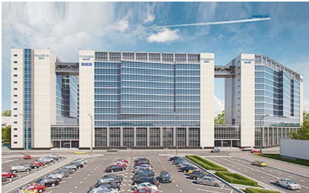
Business centre PULKOVO SKY

Business centre class B with multi-level parking, located in close proximity to the international terminal Pulkovo II