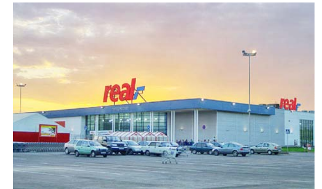
Retail complexes REAL