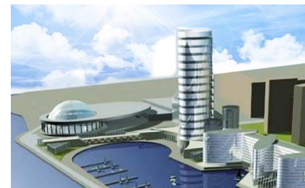
Multifunctional complex Piter Land