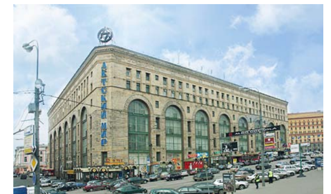
Department Store DETSKIY MIR