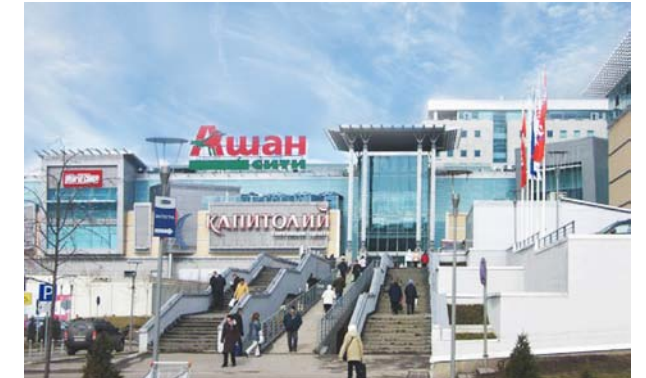
Retail complexes Kapitoliy