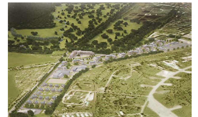
Multifunctional investment project Tsarskoselsky golf club