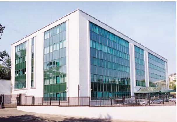
Business centre ARTYOM