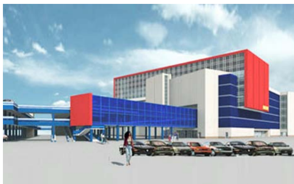
Retail complex MIRAMAX