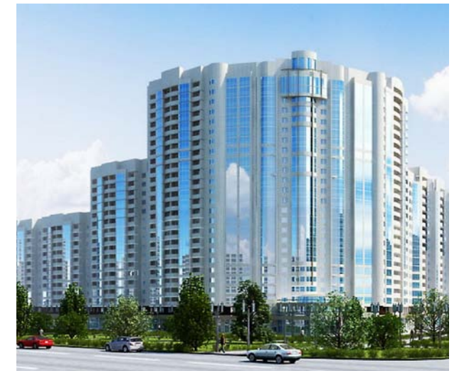
Residential complexes: Chertanovskiy, Residential district Yaroslavskiy, Levoberezhniy